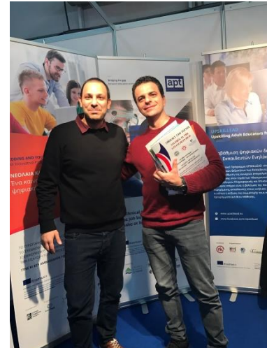
Career Counselor of the Ministry of Education and Culture