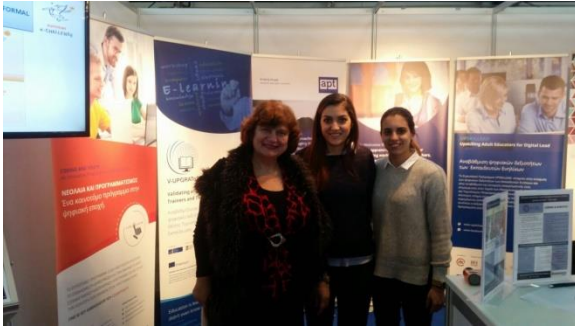
Permanent Secretary of Ministry of Education and Culture