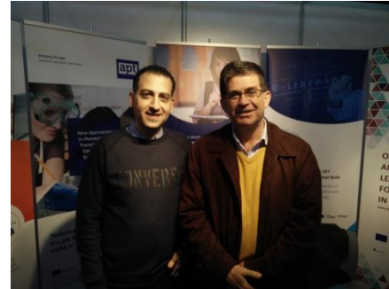
Member of Parliament