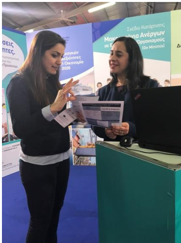
Representative of the Human Resource Development Authority of Cyprus